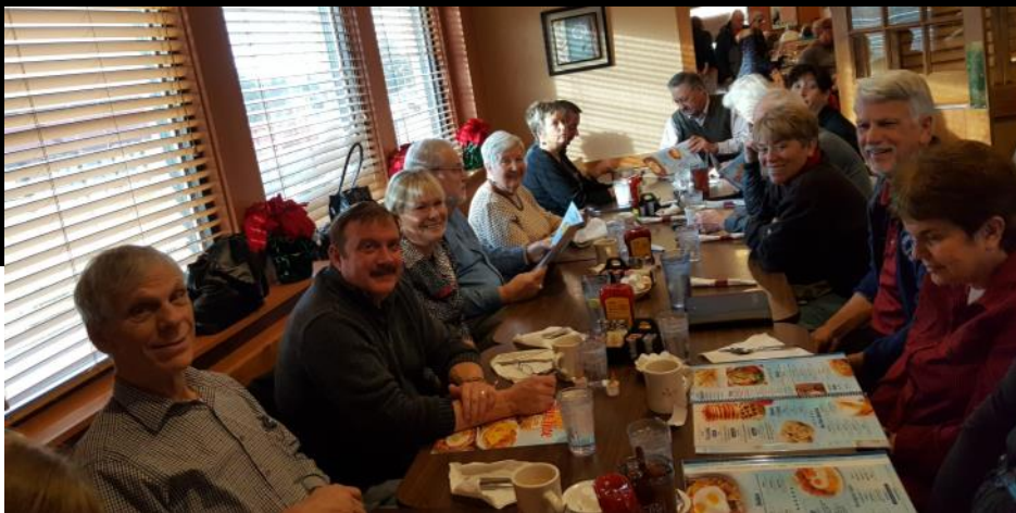
MBCA - Three Rivers